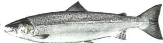
ATLANTIC/LANDLOCKED SALMON Salmon have limited black spots on body.